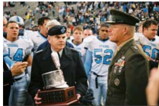
The Silver Shako is presented to The Citadel after the game.

forth game that was tied at 7-7, 14-14 and then 21-21. The